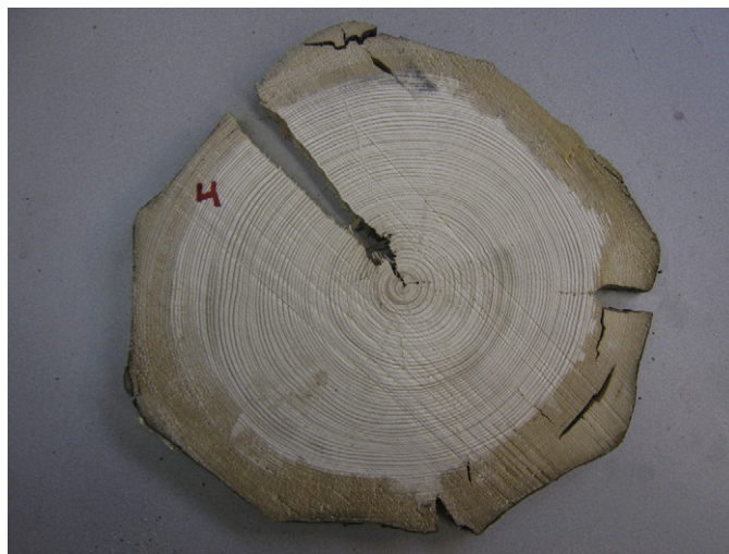
Fig. 5. Three-hundred-and-fifty-year-old spruce pile (∅ 16 cm) degraded in the sapwood only by bacteria.

Until the 1980s of last century, it was believed that no decay was possible when wood was stored under water. Colonisation by bacteria of ponded wood was not to be considered as real wood decay [14]. Those bacteria cause an increased permeability by attacking the pith membrane but were thought to ignore the woody cell wall. Professor Nilsson from Uppsala, Sweden was one of the first scientists that showed that there are also bacteria that degrade the woody cell wall. They degrade wood in consortia of several species and are always present where wood is in soil contact. Their decay velocity is low but they can be active without oxygen supply