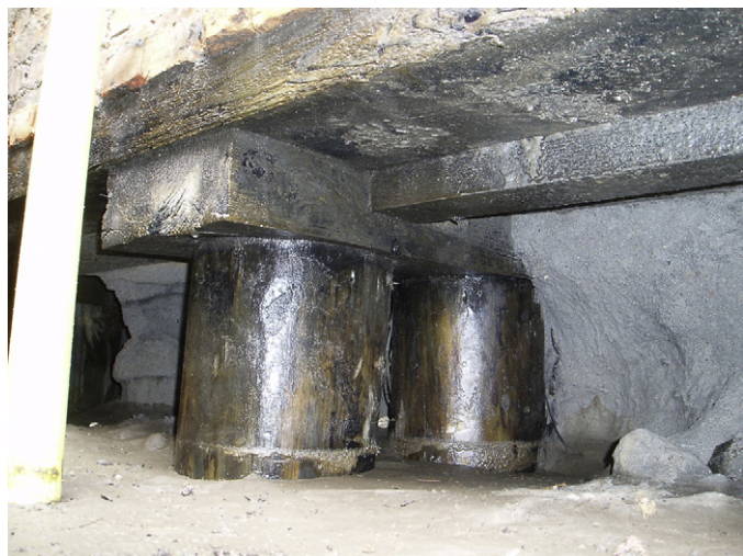
Fig. 1. A commonly used foundation construction in the Netherlands of pile pairs, the so-called Amsterdam foundation type .