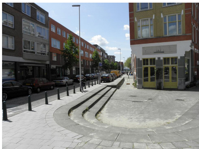
Fig. 4. Adaption of the street level to the houses with a high but homogeneous settlement because of negative skin friction, Rotterdam 2010.