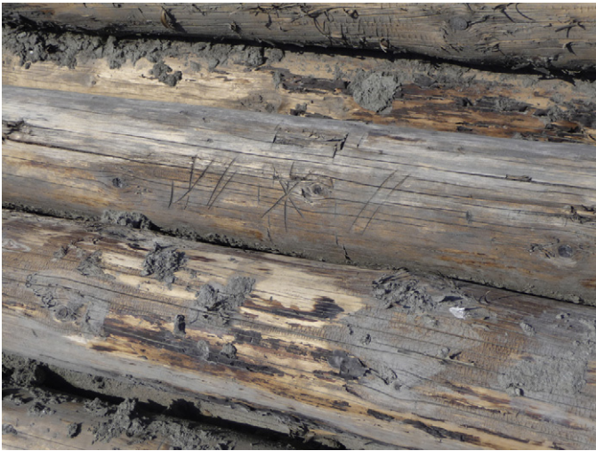
Fig. 3. Signs on pile tips of > 100 years old extracted piles.

foundations piles can therefore give additional information for historians to complete their understanding of the way of building in the past, e.g. [9].